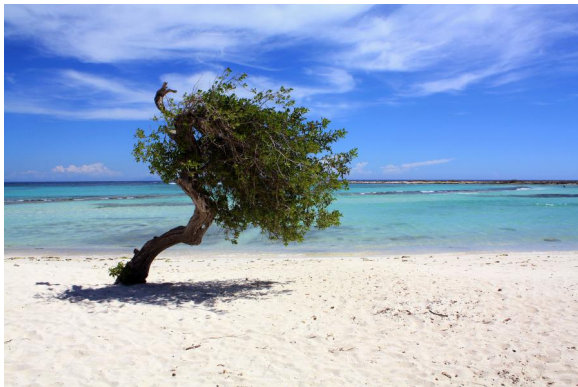
Aruba. Author - Vlad Podvorny.

Mat, DL4MM will be active again as P40AA from Aruba Island, IOTA SA - 036, 18 - 28 January 2025. He will operate on HF Bands, CW, SSB, FT8, including activity in CQ WW 160m CW. He will operate in Single Operator Assisted Category.