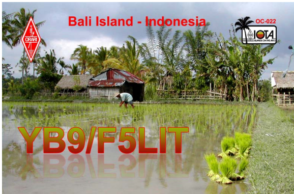
Bali Island. YB9/F5LIT QSL.

Emmanuel, F5LIT will be active again from Bali Island, IOTA OC-022, 28 January - 18 February 2025, as YB9/F5LIT. He will operate on HF Bands.